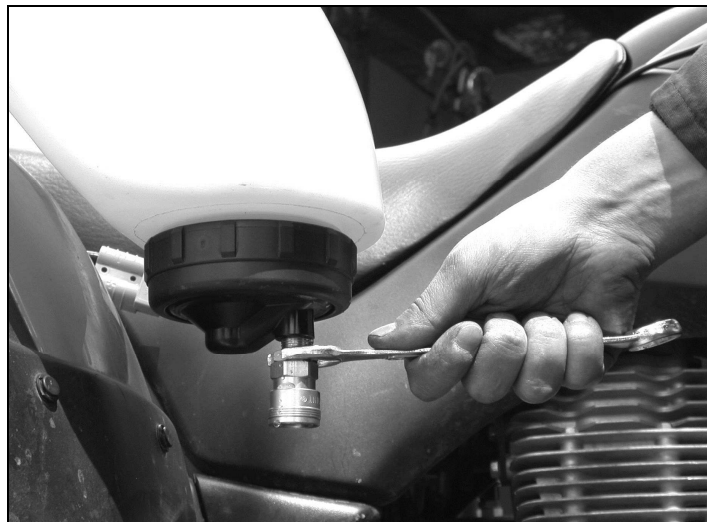
Brass quick coupler installation

If your Sprayrider™ G2 valves do not have a plug screwed into the bottom cap please contact C-Dax LTD – Freephone 0800 230 230.